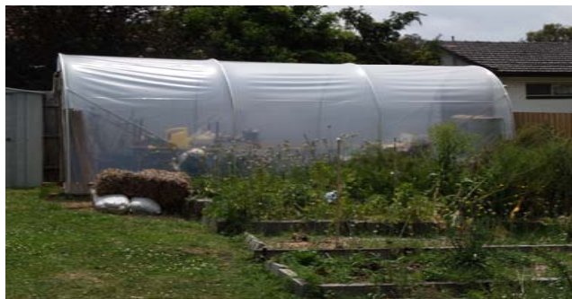
Vermont Shed Garden Area

All levels of skill are encouraged to attend and to contribute in ways that suit each participant.